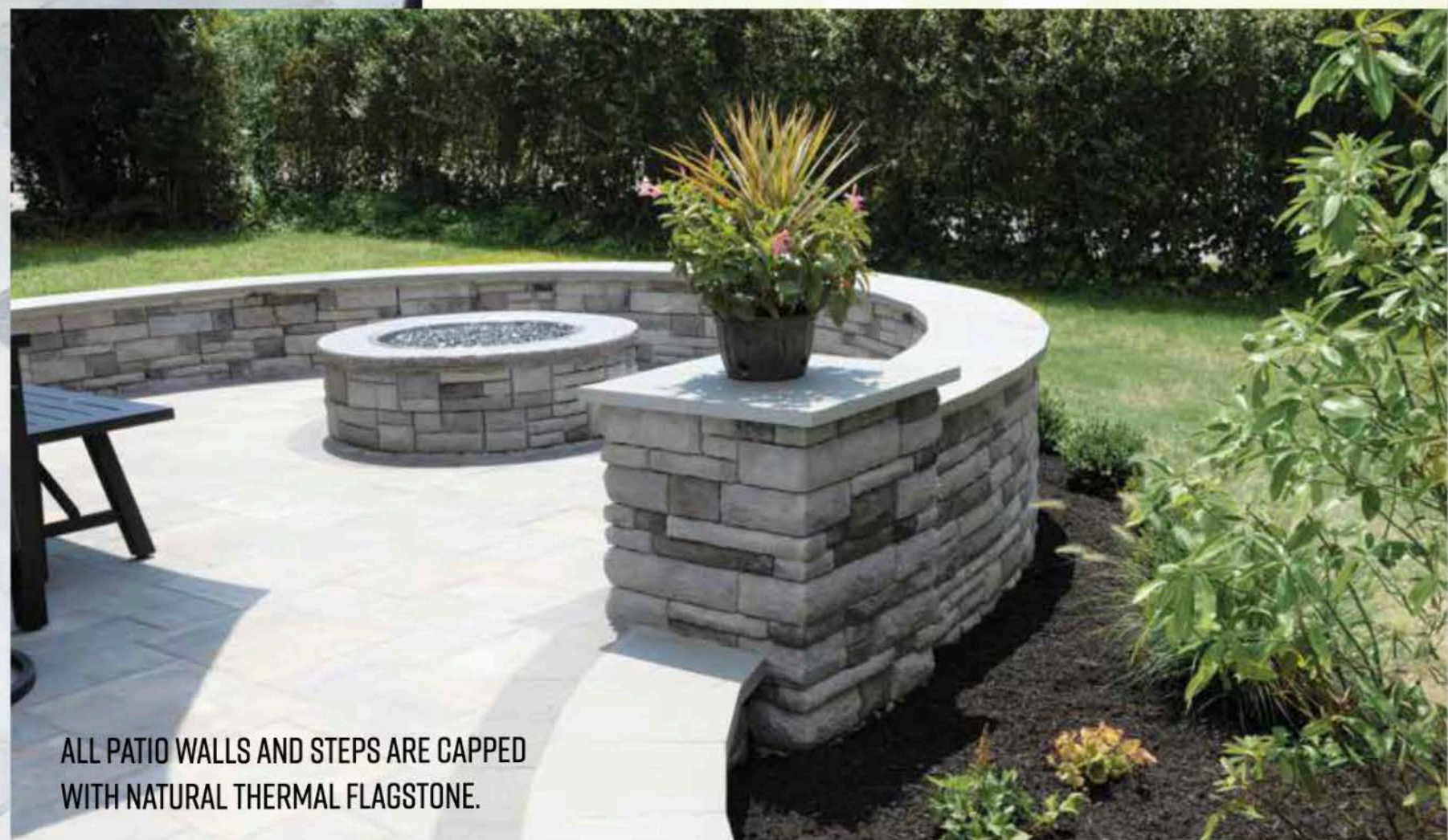
ALL PATIO WALLS AND STEPS ARE CAPPED WITH NATURAL THERMAL FLAGSTONE.